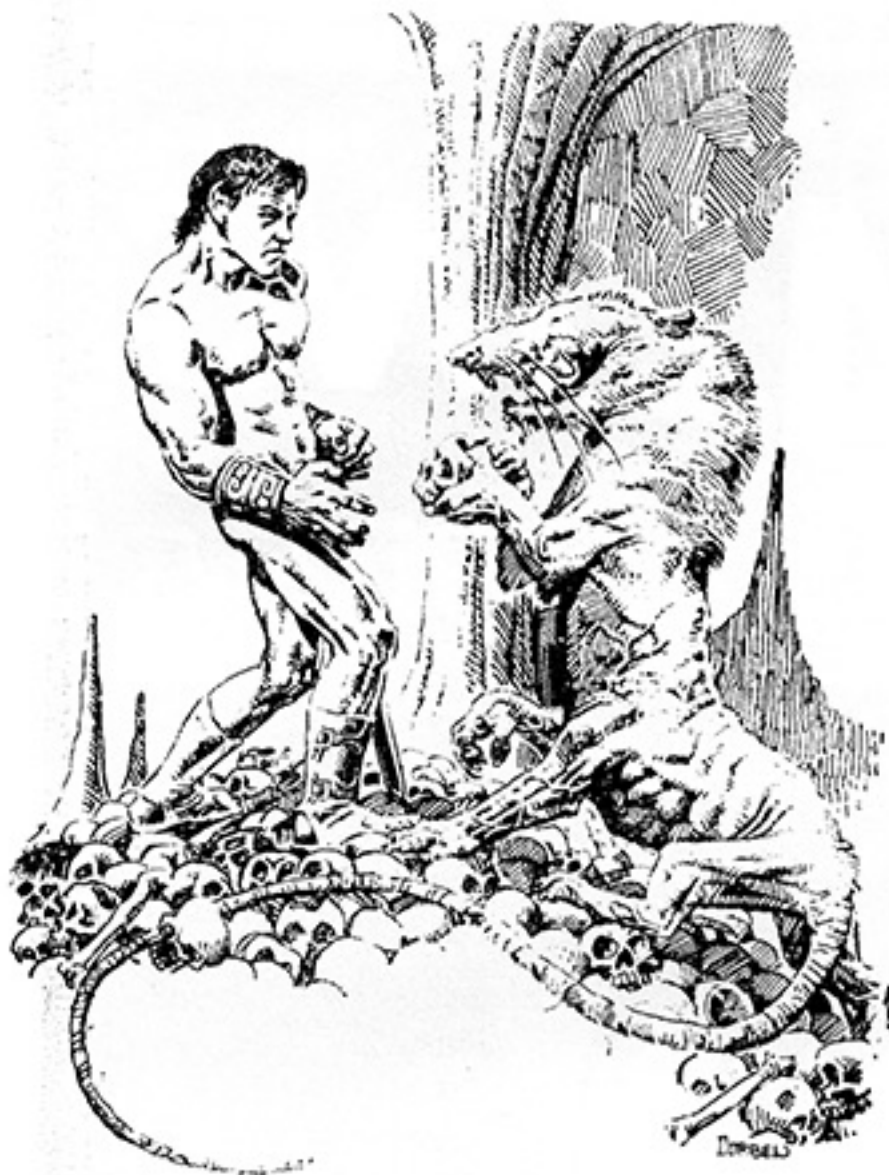
"The King of Rats . . . advanced slowly toward Carter."

A Richard Corben illustration from the 1977 Nelson Doubleday edition.